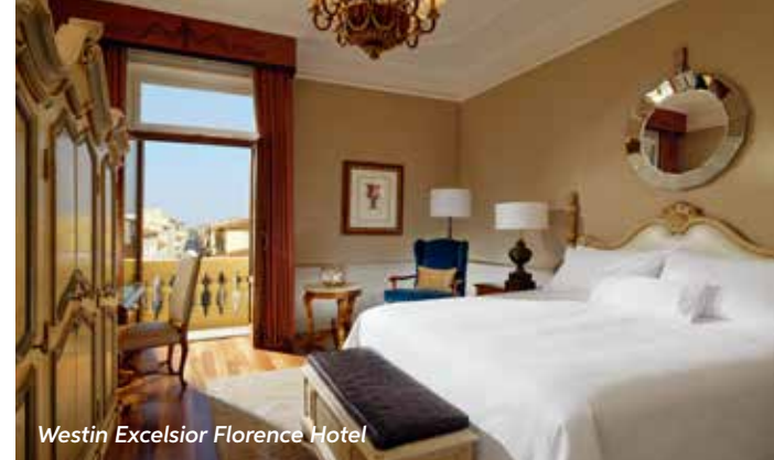
Westin Excelsior Florence Hotel