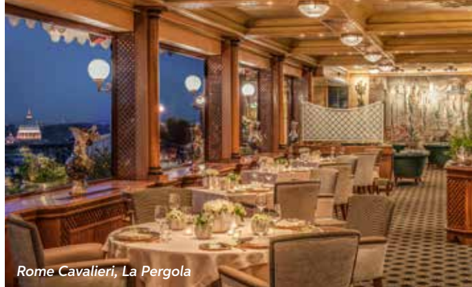
Rome Cavalieri, La Pergola