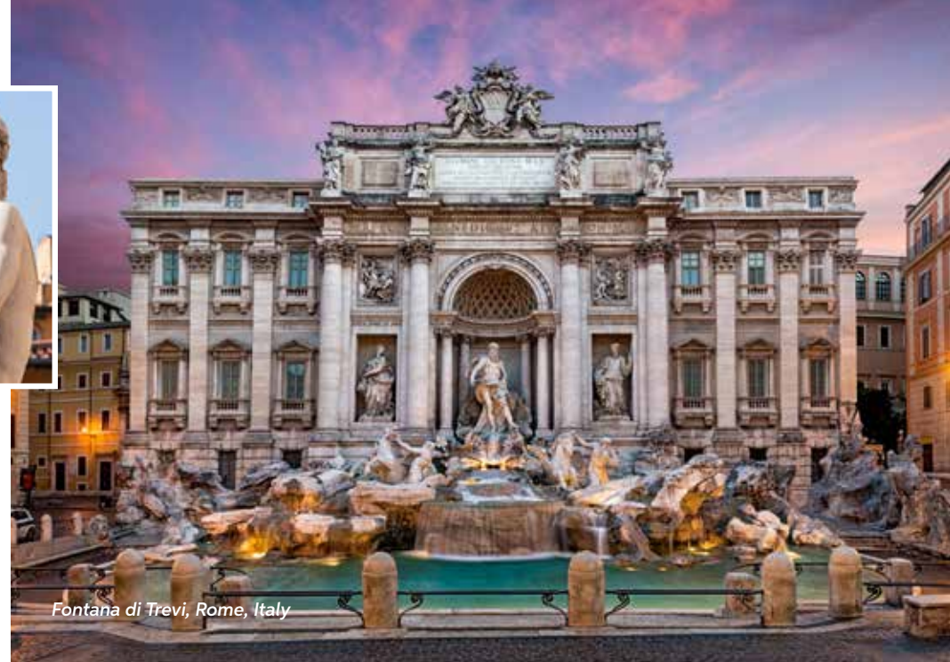
Fontana di Trevi, Rome, Italy