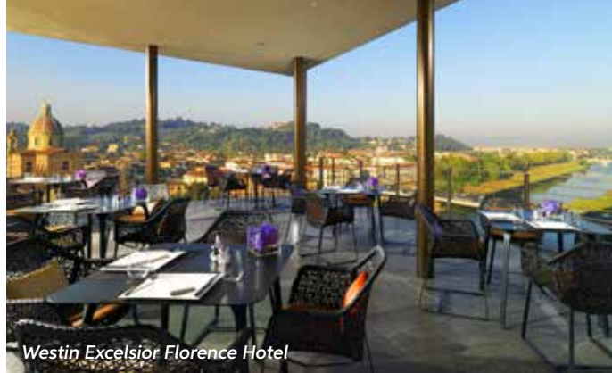
Westin Excelsior Florence Hotel