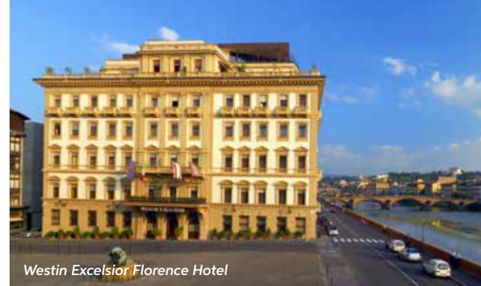
Westin Excelsior Florence Hotel