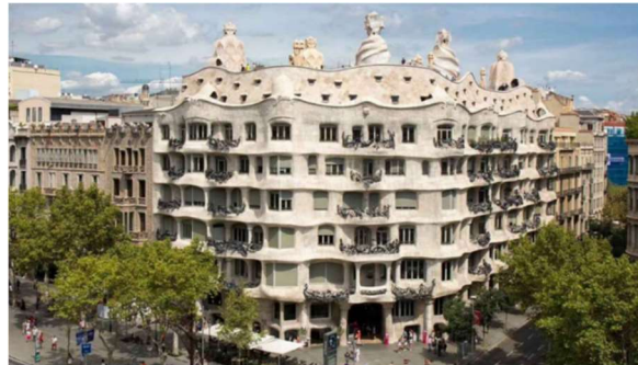
Passeig de Gracia