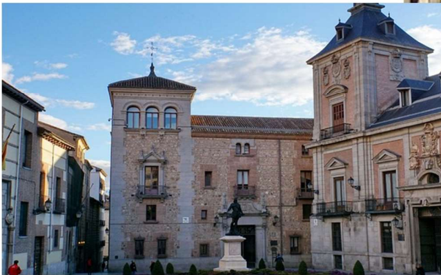
Casa de Cisneros