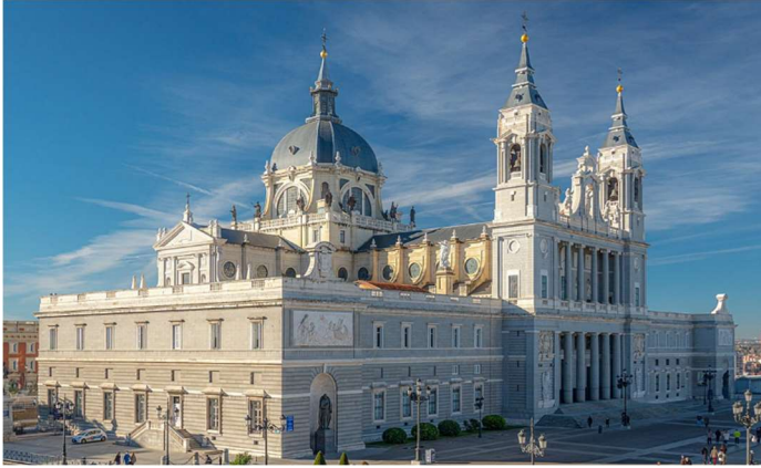
Almudena Cathedral (will see it from the plaza at the Royal Palace)